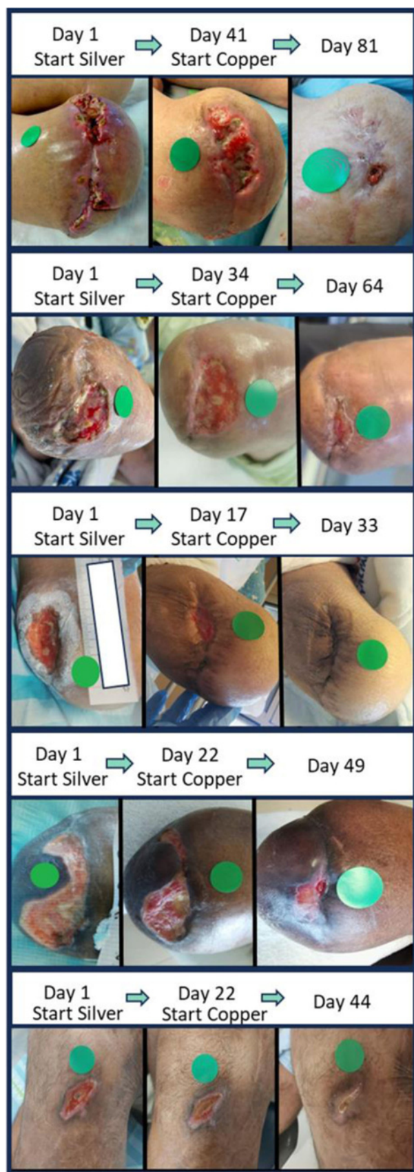
FIGURE 2 Representative pictures of wounds treated initially with silver dressings and then treated with copper dressings.