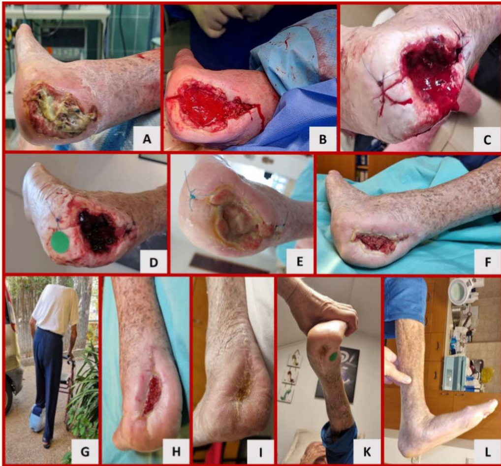
Figure 4: Healing of pressure injury after partial calcanectomy.

While NPWT is the typical treatment for such cases, the decision was made to continue with the COD treatment. A bilayer copper dressing was packed into the wound and a larger COD dressing covered the heel and the nearby area. Gradually granulation tissue filled the wound and skin crawled from the sides. Once the wound was stable, a more convenient adhesive COD was applied. COD were applied 1-2 times a week; granulation tissue formed, and the wound gradually decreased in size while undergoing epithelialization (Figures 4D-G). Throughout this period, the patient was mobile (Figure 4H). At 3.5 months, the wound was successfully closed (Figure 4I). Antibiotic was prescribed for only 5 days post-surgery. In this case the COC approach is expressed by antibacterial activity, granulation tissue formation, and epithelialization.