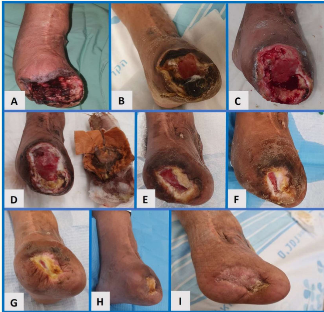
Figure 3: Healing and full closure of trans-metatarsal amputation stamp with large exposed bone.