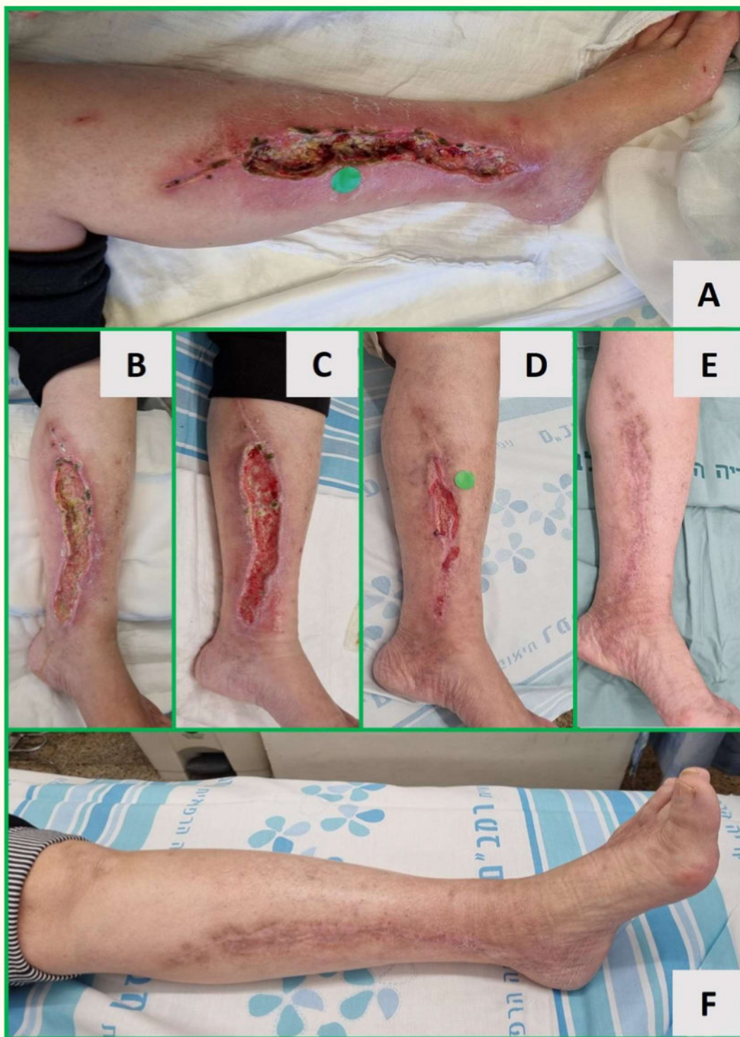
Figure 5: Healing of a venous harvesting site.