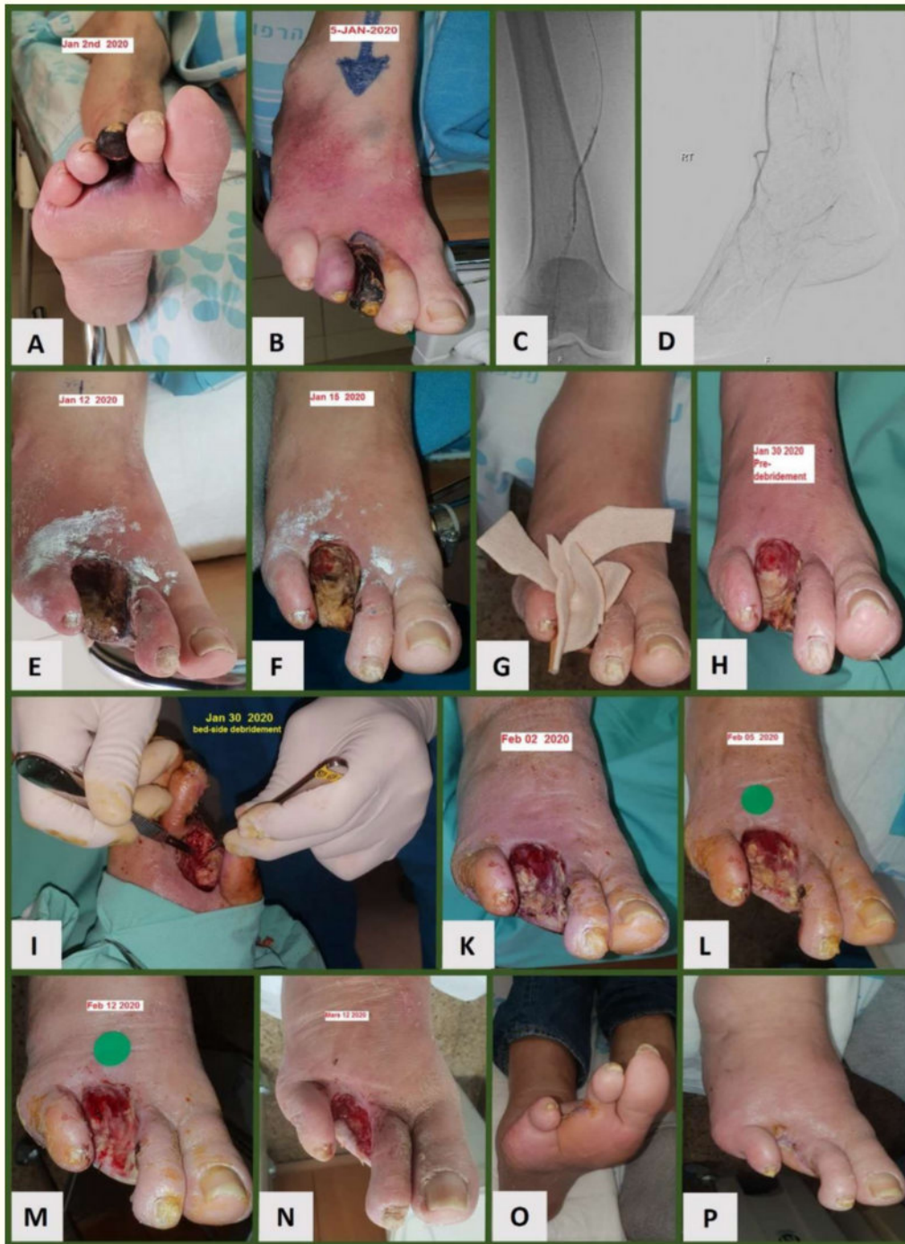
Figure 2. Healing of ray amputation in a diabetic vasculopathic patient on hemodialysis.