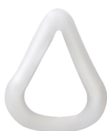
Wide Profile (RM)™