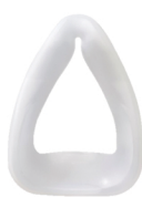
Chin Support (FP)™