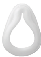
High Profile (RP)™