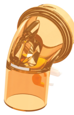
Anti-Asphyxia with Leak